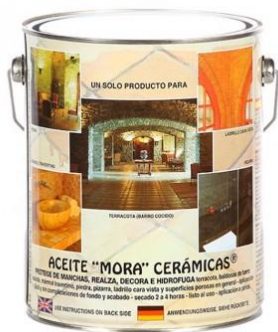
ACEITE MORA CERAMICAS MATE (3 COATS)