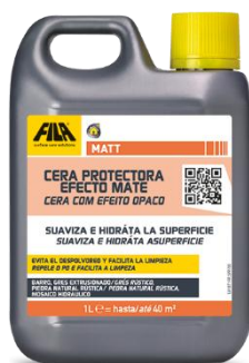
FILA MATT → FINISH WAX (1 COAT)