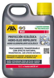
FILA W68 → PROTECTIVE (2 COATS)