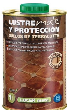
LUCER MATE → FINISH WAX (1 COAT)