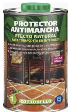
COTTOBELLO → PROTECTIVE (2 COATS)